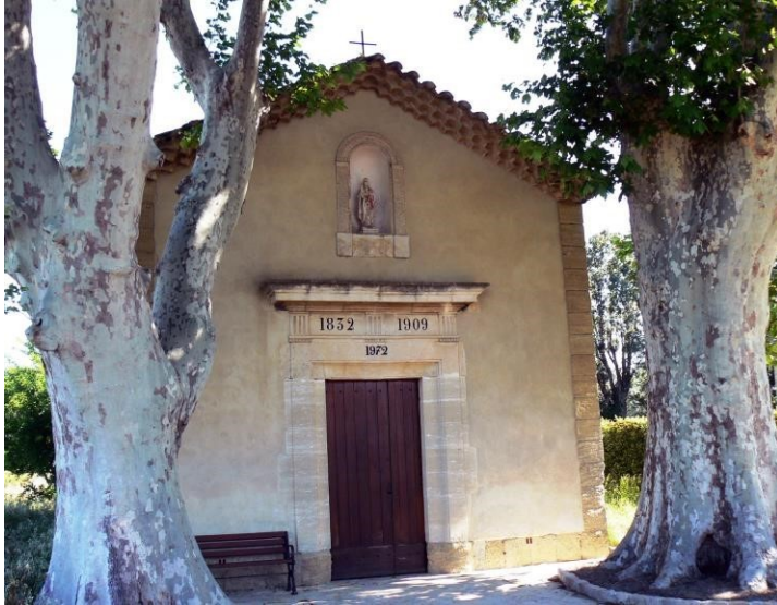
The Chapeloin the field of Laplan, in Gabet.